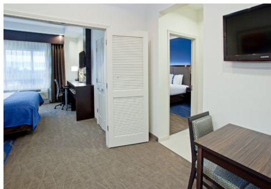
2 Bedroom Suite